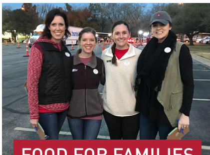
FOOD FOR FAMILIES