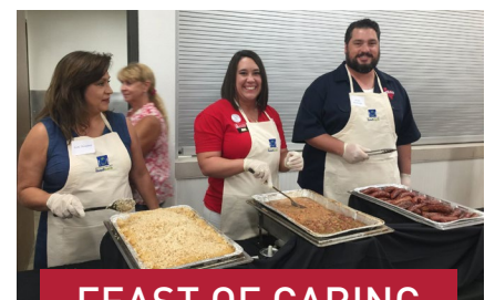
FEAST OF CARING