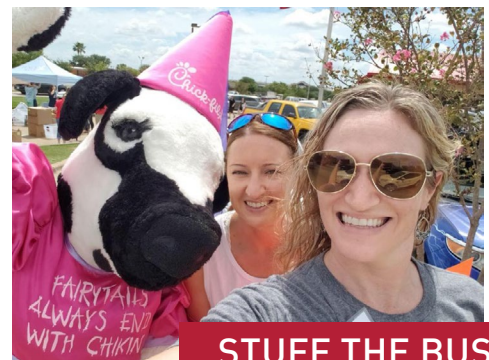
STUFF THE BUS