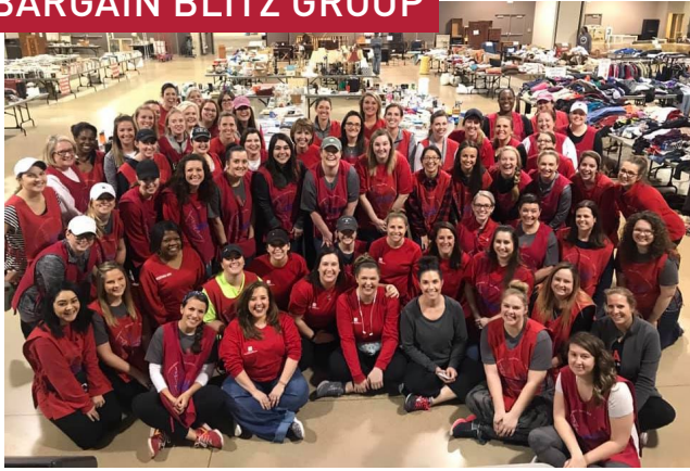
BARGAIN BLITZ GROUP